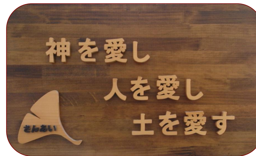
Sanai means “Spirit of Three Loves” ( Love God, Love people and Love soil)

〒369-0212 Kushibiki 1 5 - 2, Fukaya city Saitama Prefecture. Tel: 048-585-0605